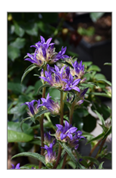
Genti Twisterbell Clustered Bellflower flowers