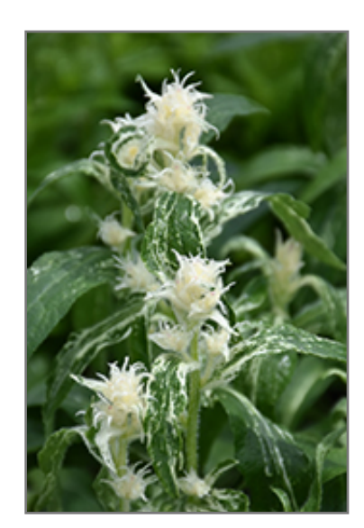
Genti Twisterbell Clustered Bellflower flower buds