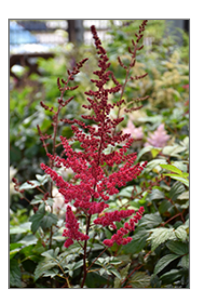
Radius Astilbe flowers

Attractive deep red plumes, rising above rich green, glossy leaves; perfect in a shady spot with dappled light; prefers moisture so water regularly for abundant flowers and nice foliage