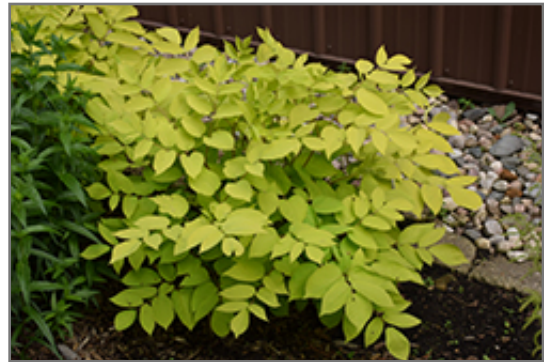
Sun King Japanese Spikenard