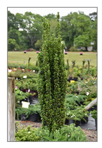
Sky Pencil Japanese Holly