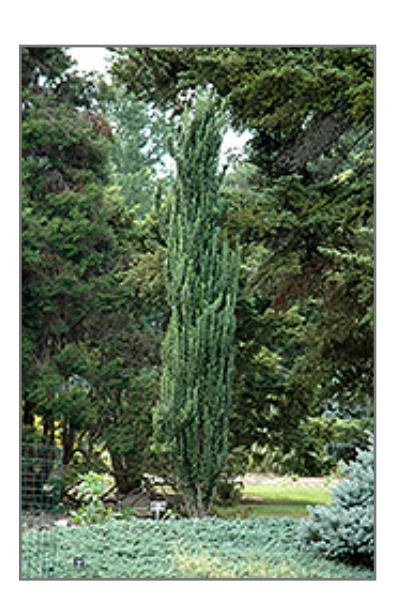
Sky Pencil Japanese Holly