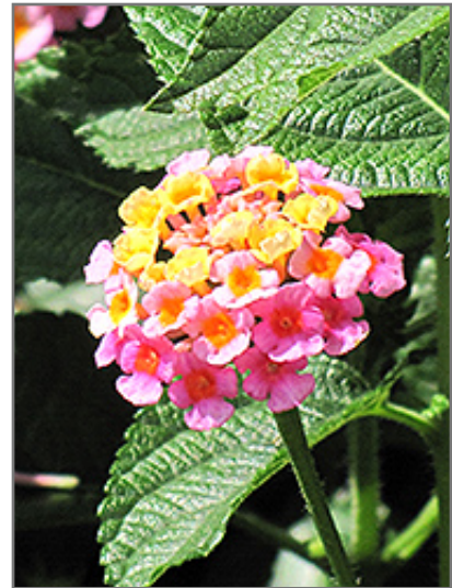
Lantana flowers