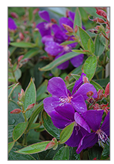
Princess Flower flowers