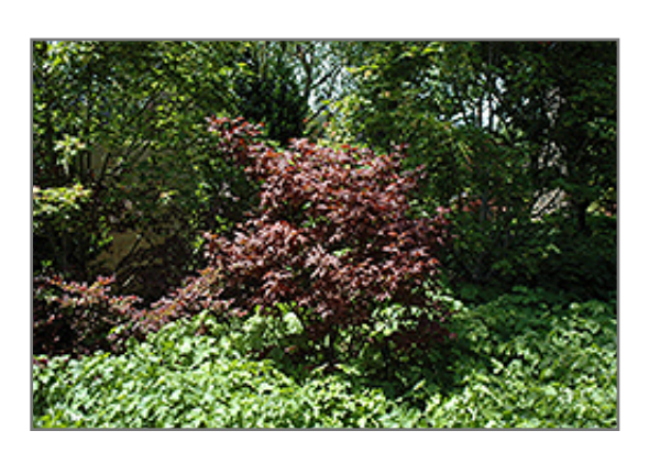
Ruby Ridge Japanese Maple

Perhaps the darkest red variety, this fine accent tree features upright compact branching and dark red spring foliage that darkens to deep maroon through summer; yellow to red shades in fall; a highly desirable specimen for the garden or landscape