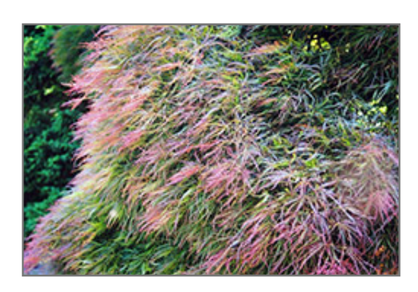
Threadleaf Japanese Maple foliage

This breathtaking small tree features thread-like foliage that emerges a rich purple, fades to green, and then takes on a rainbow of colors in fall, like nothing you've seen; extremely fine texture and dynamic colors add up to the perfect garden accent