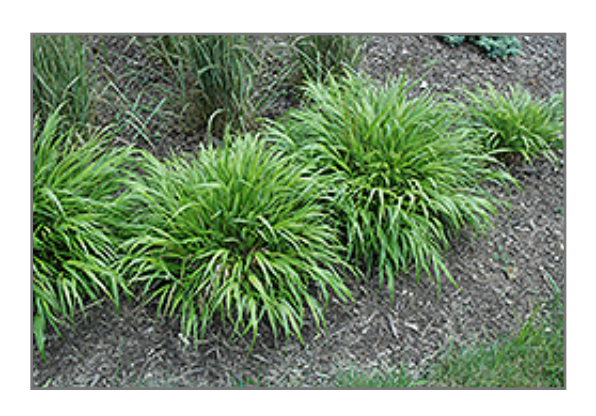
Nicolas Hakone Grass

Graceful arching grassy foliage is medium green and almost bamboo-like; beautiful along pathways, edges and containers; provide good drainage; leaves become flushed with orange and red tones in cooler fall weather