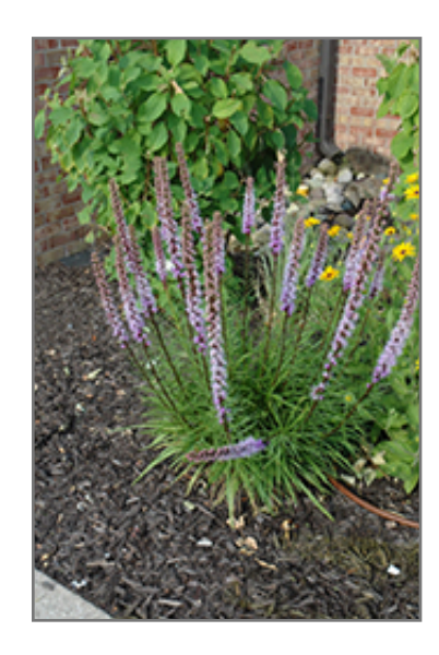
Floristan Violet Blazing Star in bloom