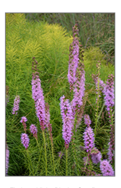
Floristan Violet Blazing Star flowers