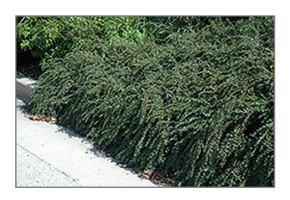
Tom Thumb Cotoneaster

Tom Thumb Cotoneaster is a multi-stemmed deciduous shrub with a ground-hugging habit of growth. It lends an extremely fine and delicate texture to the landscape composition which should be used to full effect.