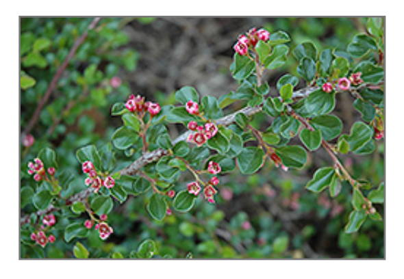
Tom Thumb Cotoneaster flowers

This shrub will require occasional maintenance and upkeep, and should not require much pruning, except when necessary, such as to remove dieback. It has no significant negative characteristics.