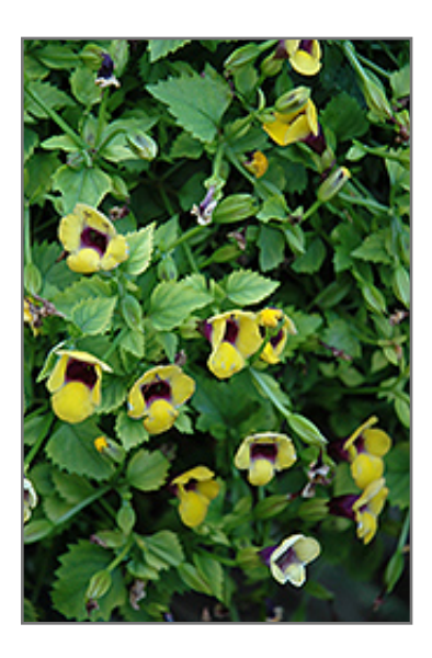
Golden Moon Torenia flowers

A vigorous variety with a bushy, trailing habit, that is suitable for planting in shaded to full sunlight areas; large, tubular flowers appear all season long; perfect for containers, hanging baskets or garden beds