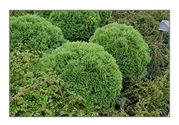
Little Giant Arborvitae

A compact globe-shaped evergreen shrub, slow growing, ideal for home landscape use, popular as a foundation shrub; hardy and adaptable, best with adequate sun, protect from drying winds