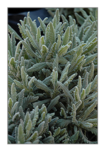
Goodwin Creek Gray Lavender foliage