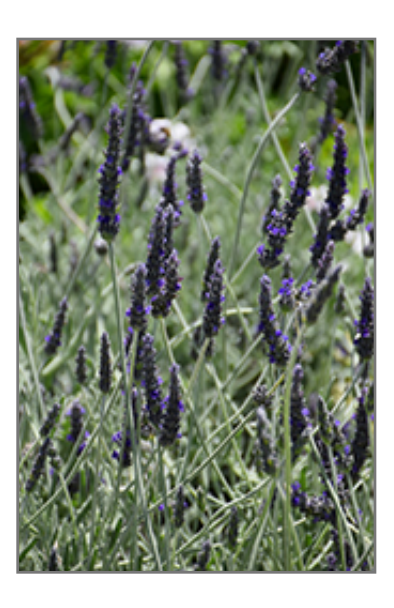
Goodwin Creek Gray Lavender flowers