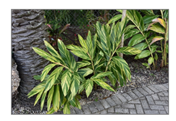
Variegated Shell Ginger