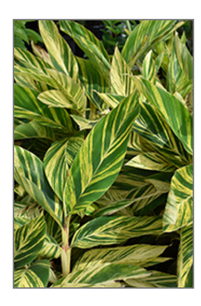
Variegated Shell Ginger foliage