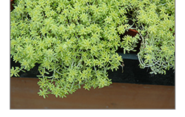
Fine Gold Leaf Stonecrop foliage