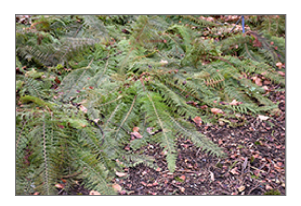
Herrenhausen Shield Fern

Herrenhausen Shield Fern is recommended for the following landscape applications;