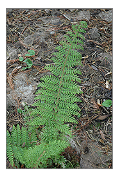
Herrenhausen Shield Fern foliage

This is a relatively low maintenance plant, and is best cleaned up in early spring before it resumes active growth for the season. Deer don't particularly care for this plant and will usually leave it alone in favor of tastier treats. It has no significant negative characteristics.