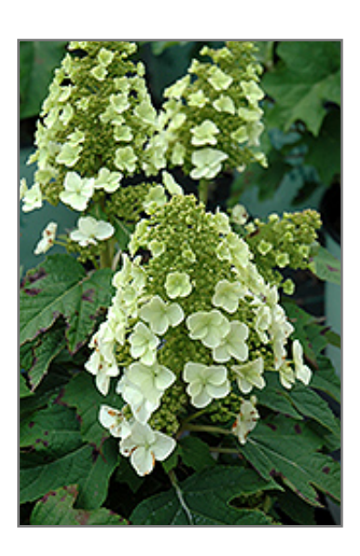
Munchkin Hydrangea flowers