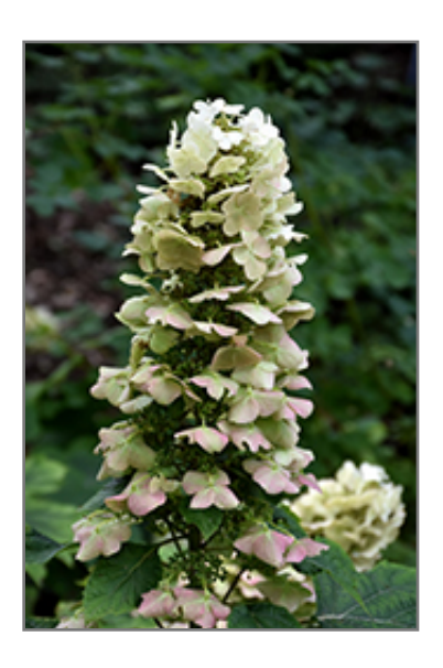
Munchkin Hydrangea flowers

This shrub performs well in both full sun and full shade. It prefers to grow in average to moist conditions, and shouldn't be allowed to dry out. It is not particular as to soil type or pH. It is somewhat tolerant of urban pollution, and will benefit from being planted in a relatively sheltered location. Consider applying a thick mulch around the root zone in winter to protect it in exposed locations or colder microclimates. This is a selection of a native North American species.