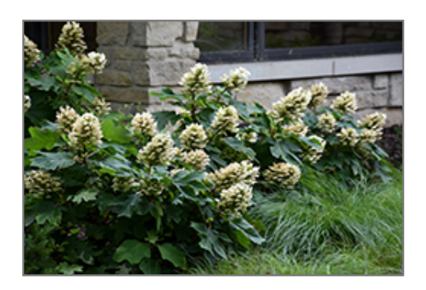
Munchkin Hydrangea flowers