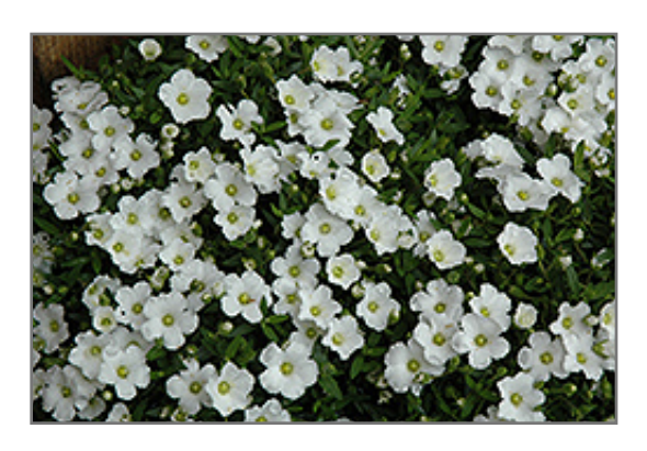
Alpine Baby's Breath in bloom

A low growing variety that is well suited for rock gardens, rock walls, or alpine troughs; a compact mound of rounded green leaves; taller branches are studded with white flowers that may have pink veins; evergreen in milder areas