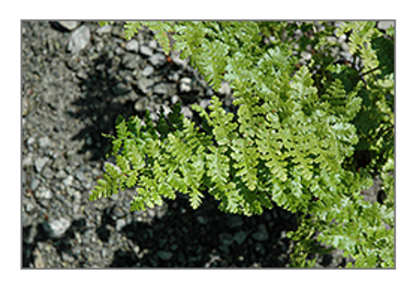
Barnesii Fern foliage

An impressive male fern producing tall narrow fronds that are very upright and dark green; clump-forming and dense, perfect for shady spots; beautiful in masses on the edges of ponds or streams