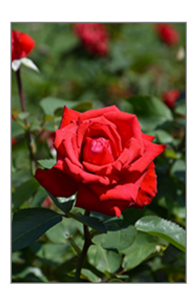
Eleganza Grande Amore Rose flowers

Eleganza Grande Amore Rose features showy fragrant crimson flowers at the ends of the branches from mid spring to early fall. The flowers are excellent for cutting. It has dark green deciduous foliage. The glossy oval compound leaves do not develop any appreciable fall colour.