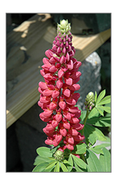
Tutti Frutti Lupine flowers

A stunning dwarf hybrid producing thick spikes of flowers with a wide color range, from yellow, pink, purple, blue and white; a tremendous visual impact massed in the garden, border plantings or in containers