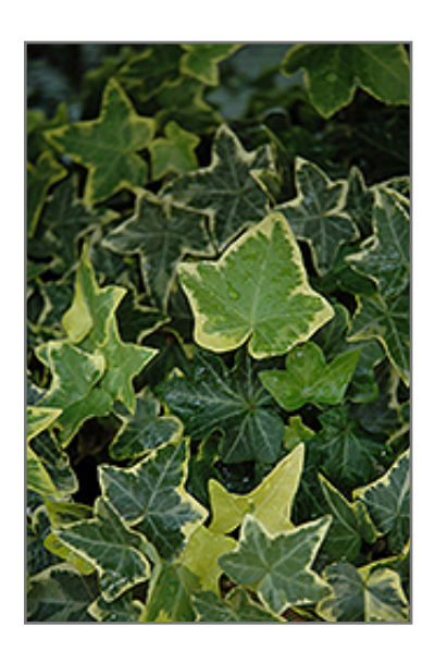
Gold Child Ivy foliage

Gold Child Ivy has attractive gold-variegated dark green foliage with hints of grayish green on a plant with a spreading habit of growth. The glossy lobed leaves are highly ornamental and remain dark green throughout the winter.