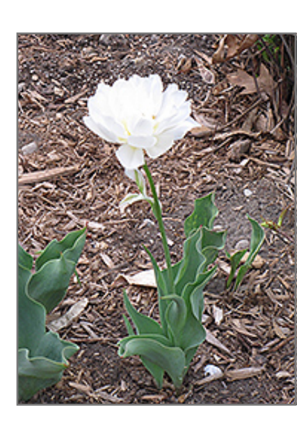
Mondial Tulip flowers

A wonderful full white bloom above sturdy stems; this variety is an early bloomer and is visually stunning in the garden, borders, or containers