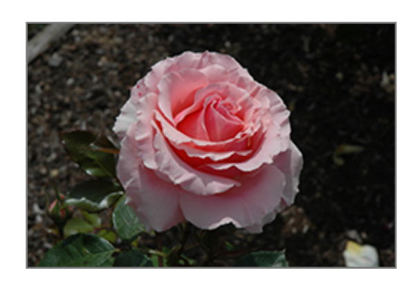
Tournament of Roses Rose flowers

This interestingvariety produces gorgeous rose pink blooms with darker pink reverses, above the deep green, glossy foliage, and are perfect for cutting; vigorous grower with excellent disease resistance