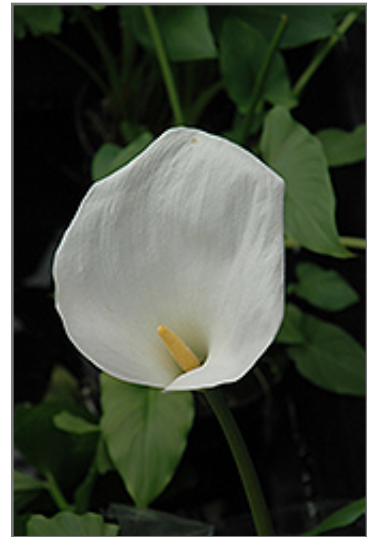
Calla Lily flowers